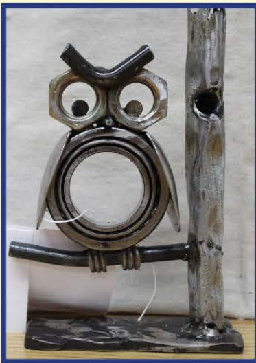
Colt Watkins Dent-Phelps R-3